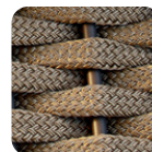
Nautic Rope Sand